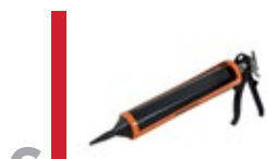
Application gun for installing the joint mortar