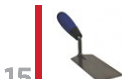
Square shaped trowel for spreading the glue