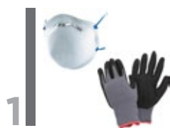
Mask / Gloves