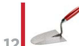
Round shaped trowel for spreading mortar