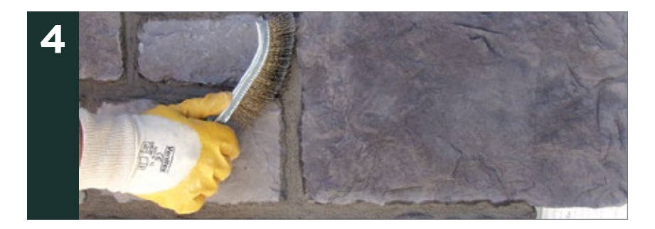
If mortars get on the surface of the stone before it hardens (after 1/2 or 1 hour) brush off the mortar with a soft wired brushed or hard plastic, do not use metal.