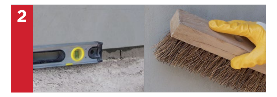
The substrate must be free of dust and dirt. Level out the first line of where the stones will be placed.