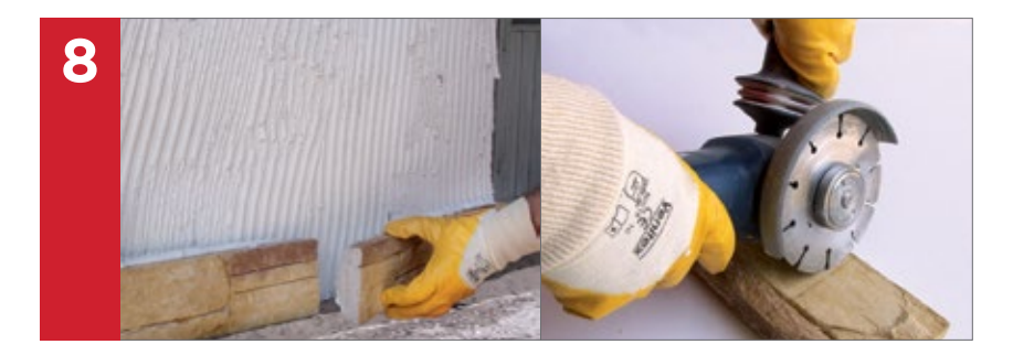
If empty gaps are large, fill them with stones by cutting them to the size needed.