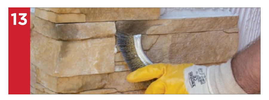
Clean the stone surface from mortar residues with a soft wire brush before the hardening of the mortar