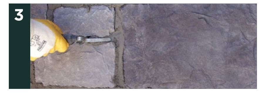
Lay the mortar with a spatula or special tool.