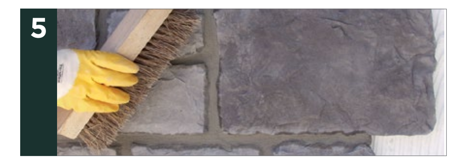
Clean the stones by using a dry paint brush.