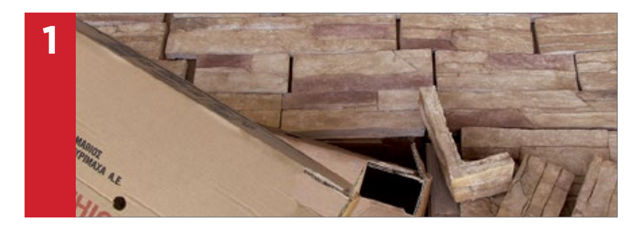
Lay out stones and mix from various cartons at least 2m<sup>2</sup> to create a balance between different colors, shapes, thickness and textures.