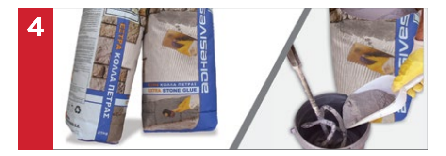
Prepare mortar taking into consideration the amount of water for good accretion and the right consistency.