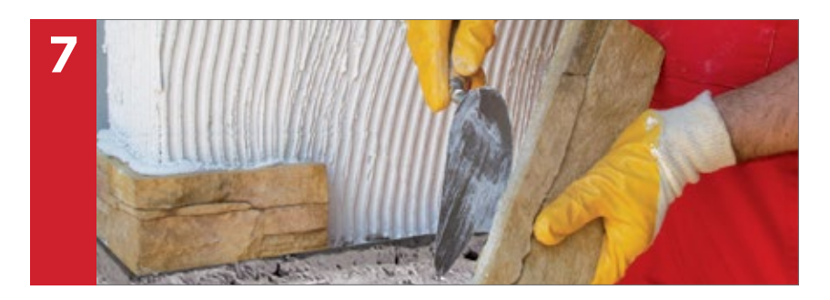
Using the spatula or resembling tool, perimetrically clean the stone from overlapping concrete for better installation. Since the back surface of the stone is dry wet it with water to avoid the absorption of water of the mortar.