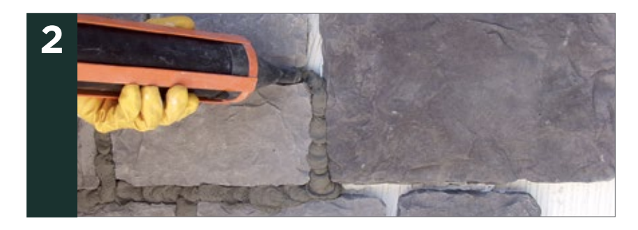
For the installation use a pastry bag or a grouting gun. In both cases effectively cut the end until the desirable width for the joint is achieved.