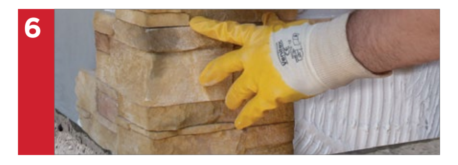
If the installation includes corners, then begin from the corner of the wall & continue the installation in line with the flat elements.