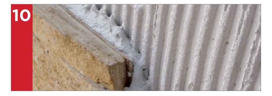
Place the stone by pressing hard to ensure a very good adherence of the mortar in the back surface of the stone.