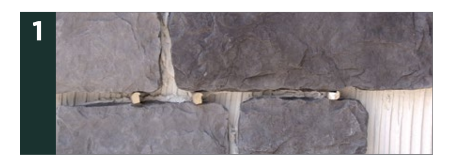
Provided that there is a joint, to stabilize the stones small spacers can be used where it is needed.