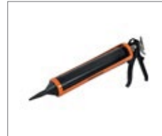
Application gun for joint mortar installation