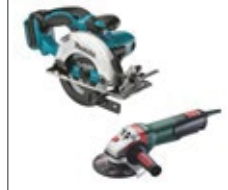
Circular cutting saw with diamond disc / angle grinder