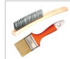
Wire brush / Paint brush