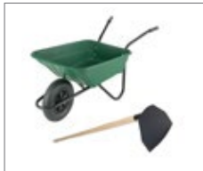
Wheelbarrow / Hoe (mortar preparation)