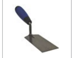
Square shaped trowel for glue spreading