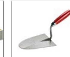
Round shaped trowel for mortar spreading